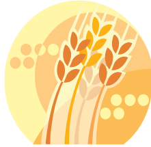
Pioneer Commodities and Trucking Merv & Pete Meenderinck